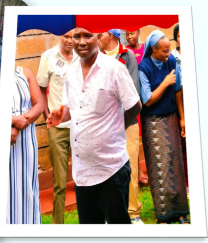
Memorable moments with family members